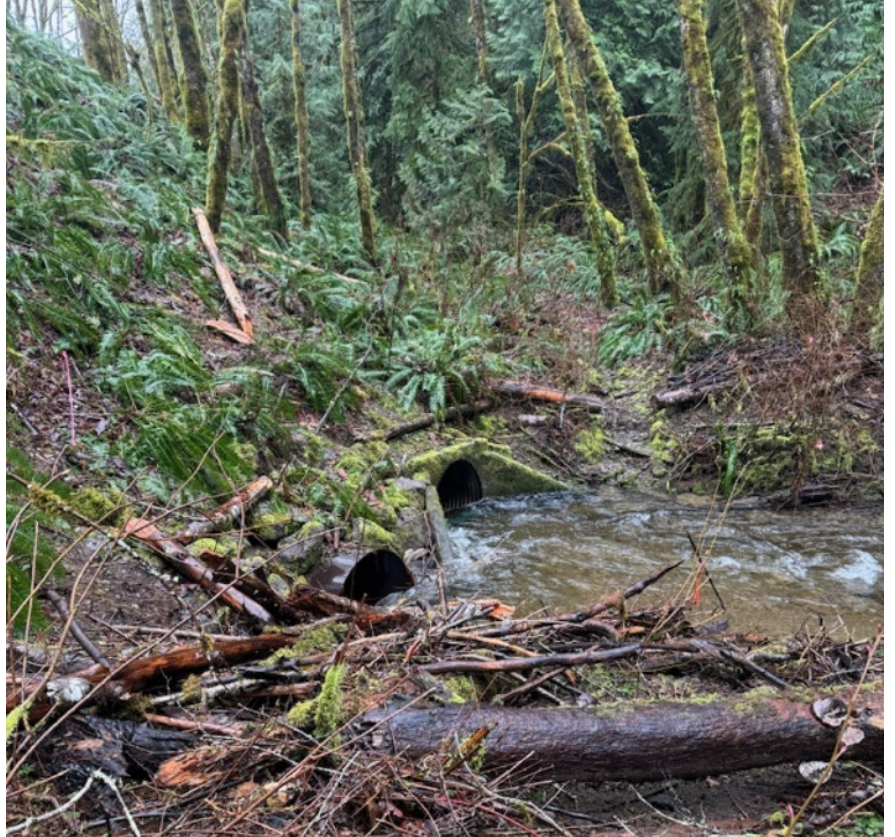
US Navy Railroad culverts are being improved for fish passage (current condition shown)