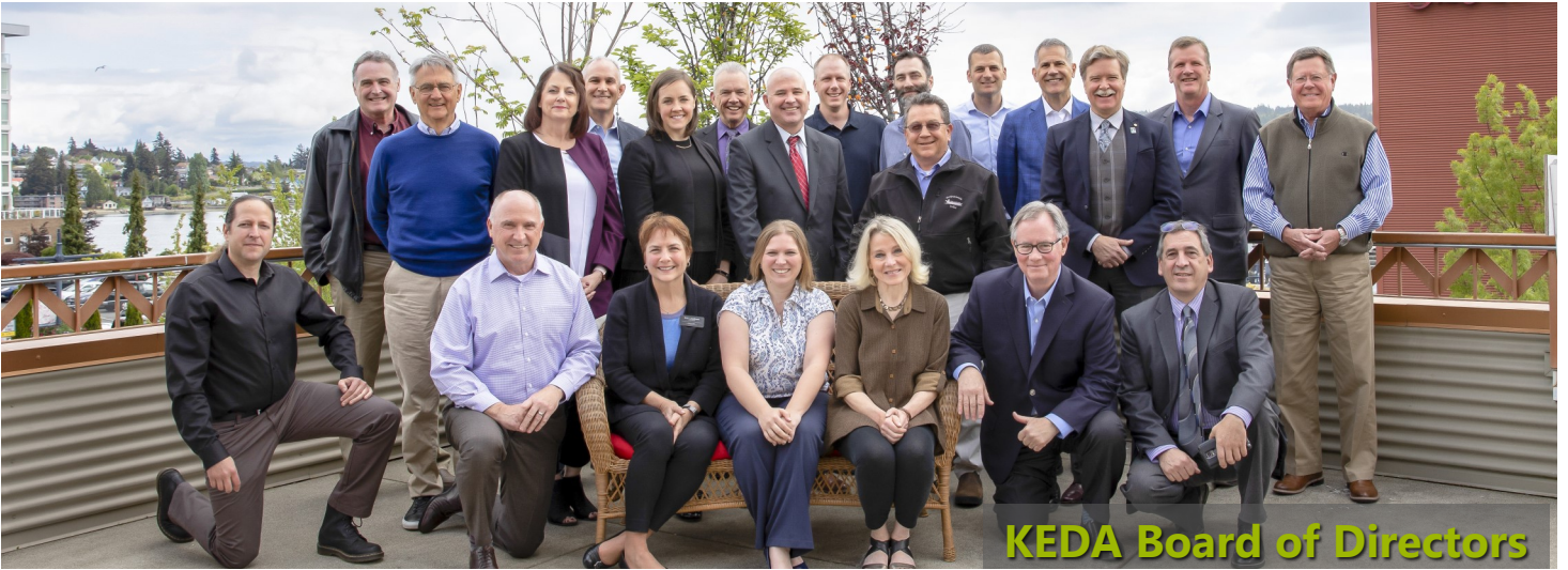
KEDA Board of Directors