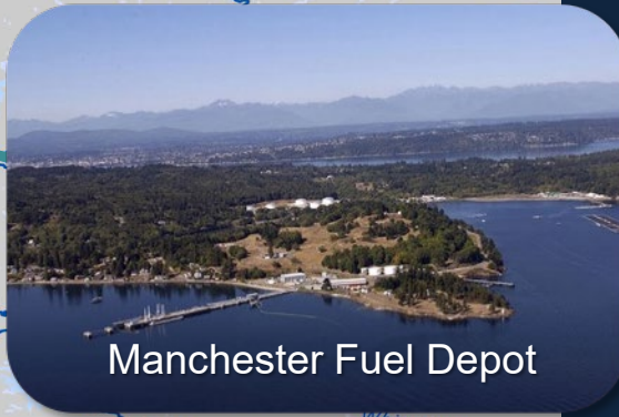
Manchester Fuel Depot