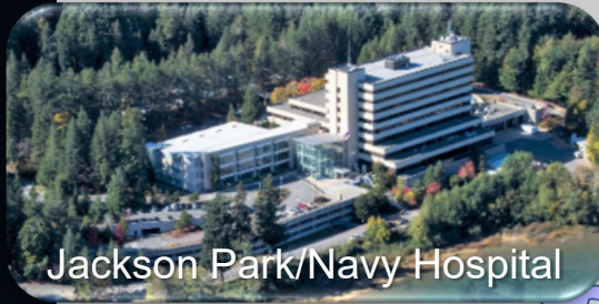
Jackson Park/Navy Hospital